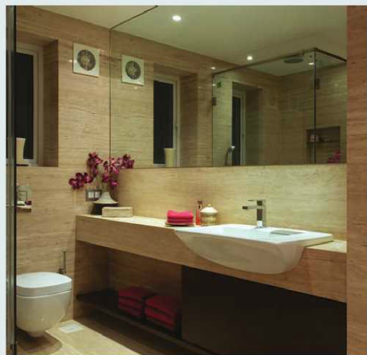
the master bathroom in beige travertine marble with dark wooden trims..

tastefully procured art and artefacts adorn the house and render a personal touch to the space. The apartment on the whole exudes a contemporary style with moments of glamour and opulence. ▲