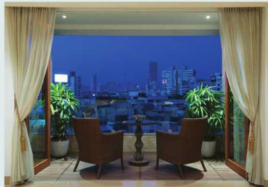
diffused lighting and dimmable LED lights.

tastefully procured art and artefacts adorn the house and render a personal touch to the space. The apartment on the whole exudes a contemporary style with moments of glamour and opulence. ▲